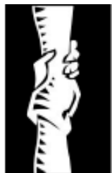
Need a Hand Lend a Hand