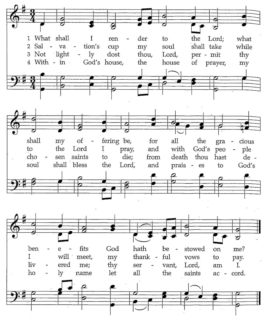
THE SECOND READING